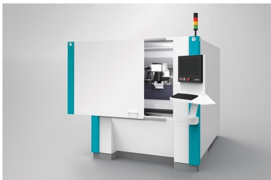
Image: The BLS 500 from Manz AG for various laser processes.

Image: Unique in the world: FOPLP redistribution layer (RDL) panel with a process area of 700 x 700 millimeters.